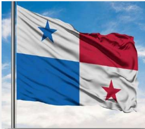
Panamanian Society of Phlebology and Lymphology Panama

We would like to extend our gratefulness to the new Member Societies that joined the UIP during the World Congress.