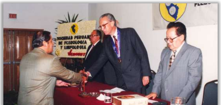
SOPEFLI oath of office