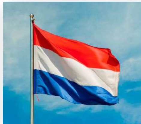
Dutch College of Phlebology Netherlands