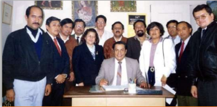
Board of Directors first meeting