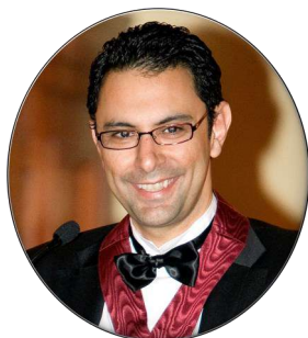
Kurosh Parsi (Australia) President

On September 15, 2022, the International Union of Phlebology General Council voted the new Executive Committee, which is comprised of: