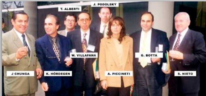
First International Congress—SOPEFLI, 1998

The scientific activity of the society has been constant, because of this work and the support of colleagues from different countries, it has achieved recognition by the International Union of Phlebology, by the Pan-American Society of Phlebology and Lymphology, as well as other national societies, and in our country over the years has been forming groups of doctors who now exalt the Peruvian Phlebology.