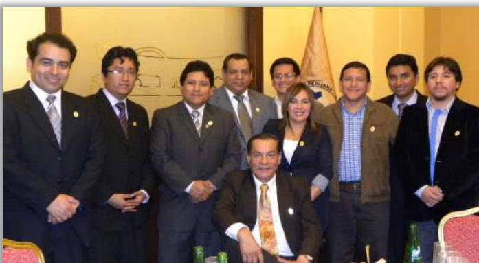
SOPEFLI fellowship meeting