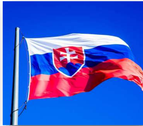
Slovak Society of Angiology & Slovak Medical Society Slovakia