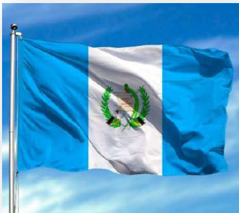
Guatemalan Phlebology Association Guatemala