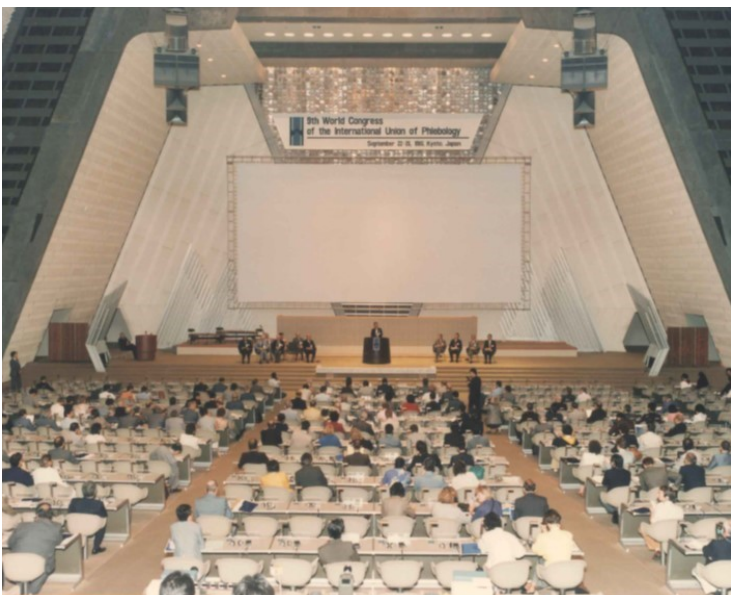
The Plenary Hall of the 9th World Congress of the UIP, in Kyoto, Japan, 1986

Department of Vascular Surgery, Nishinokyo Hospital